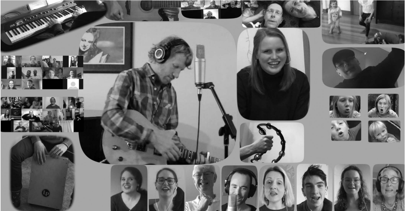
Victory song played and sung by musicians from St Mark's Bellerive in their homes

A Church for Tasmania, making disciples of Jesus.