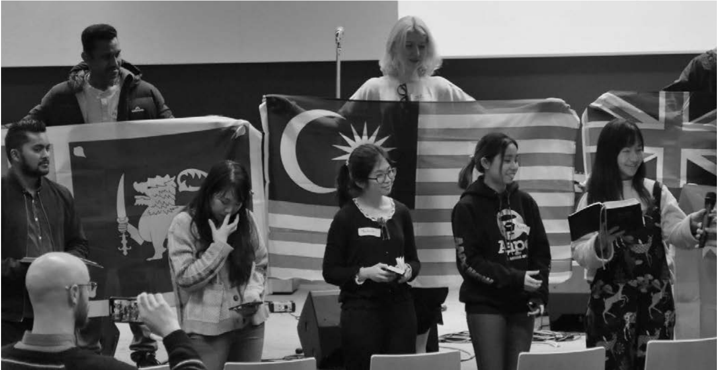
International students reading John 3:16 in their native language

A Church for Tasmania, making disciples of Jesus.