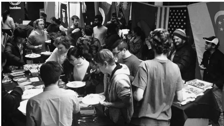
Shared meal after the 'Buddies' service