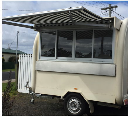
'A Cup of Kindness'