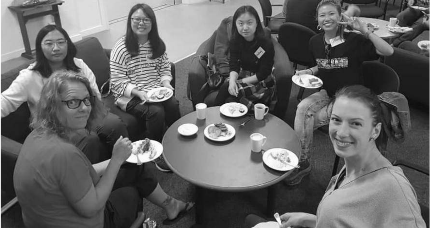
The English Language Café at Barney's Anglican in North Launceston

A Church for Tasmania, making disciples of Jesus.