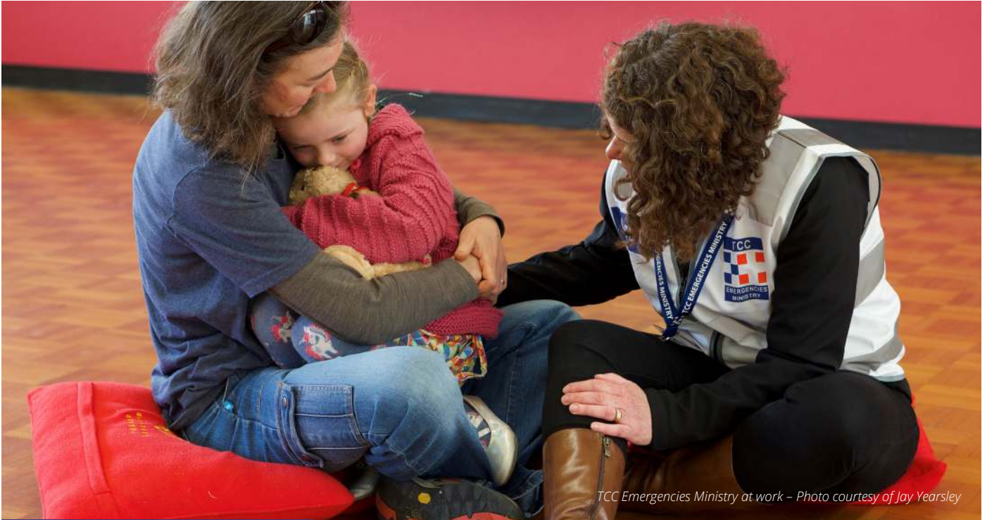
TCC Emergencies Ministry at work – Photo courtesy of Jay Yearsley

A Church for Tasmania, making disciples of Jesus.