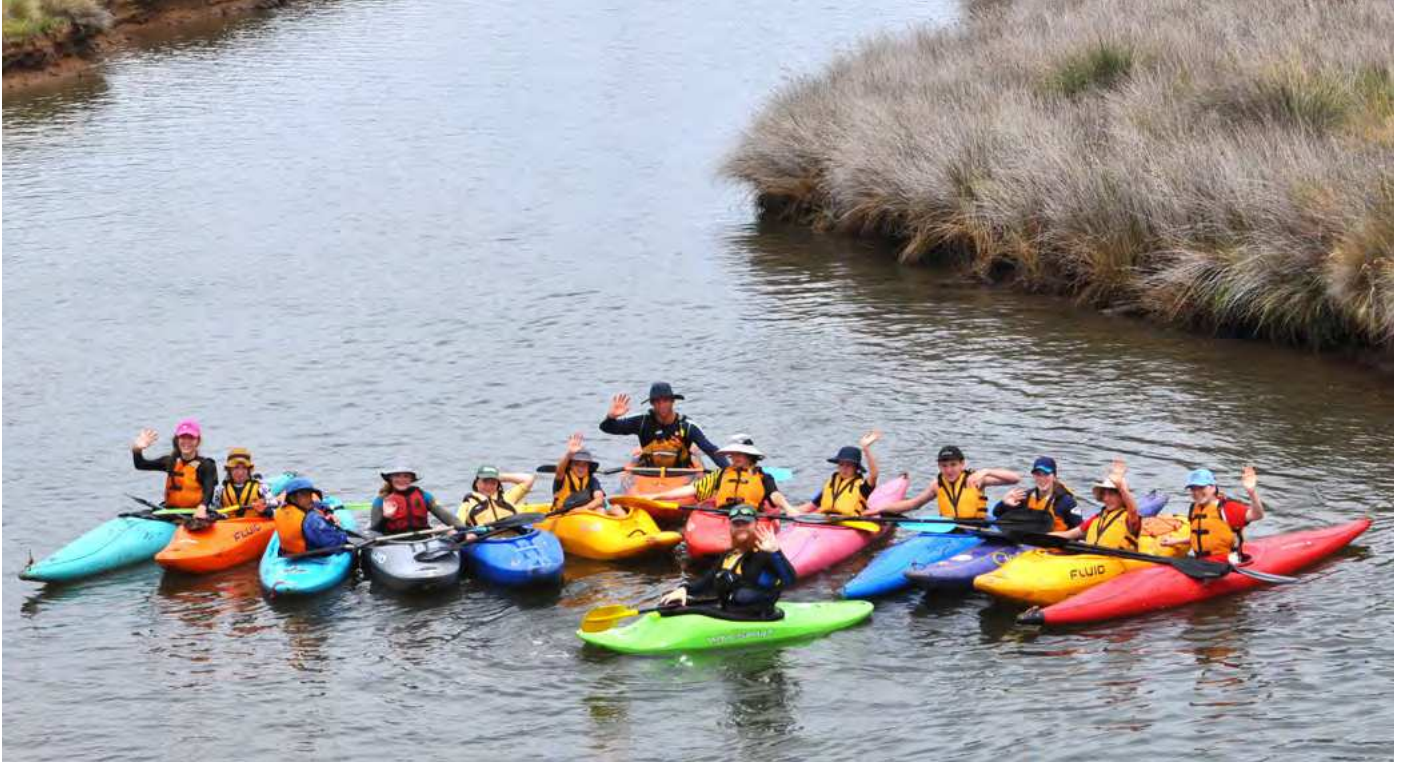
Mayfield Camp

A Church for Tasmania, making disciples of Jesus.